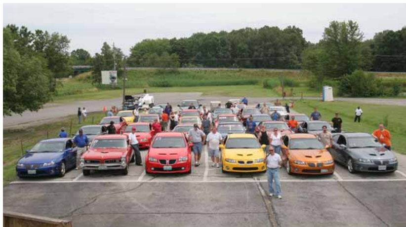
Gateway GTO Drag Day June 28, 2008