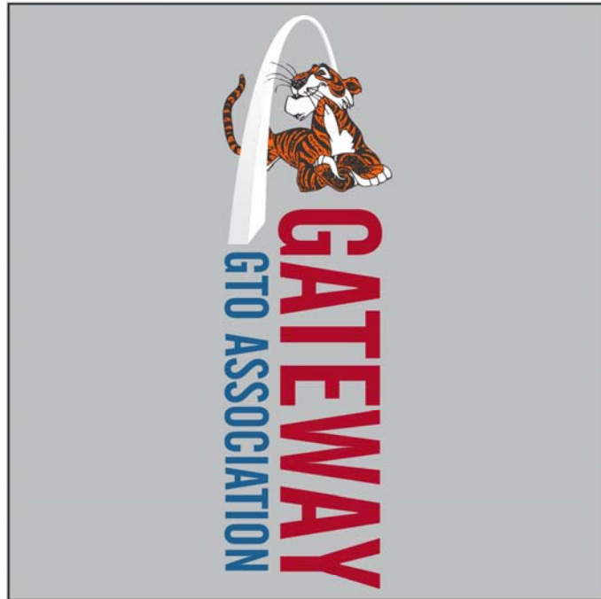
FULL FRONT - 4.5" W x 15" H