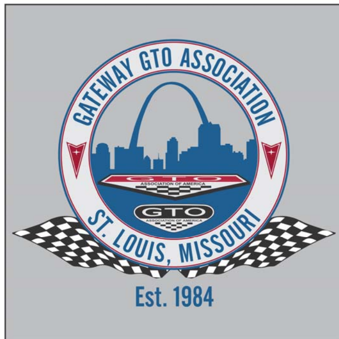
FULL BACK - 12" W x 10" H